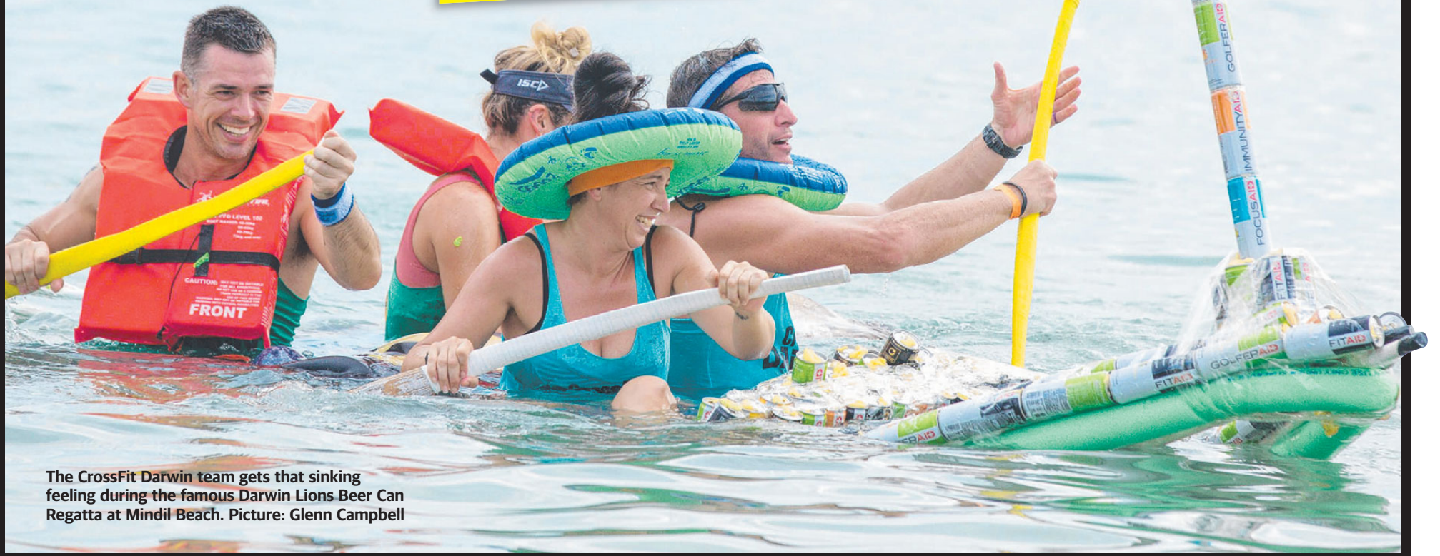
The CrossFit Darwin team gets that sinking feeling during the famous Darwin Lions Beer Can Regatta at Mindil Beach.

Chief Minister commits to tackling worsening Territory scourge