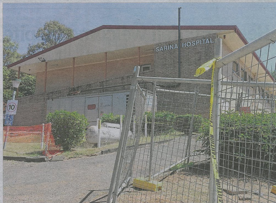
'NO PLANS TO MOVE': Sarina Hospital undergoing construction in 2013.

"This could be a project worth $100 million or more