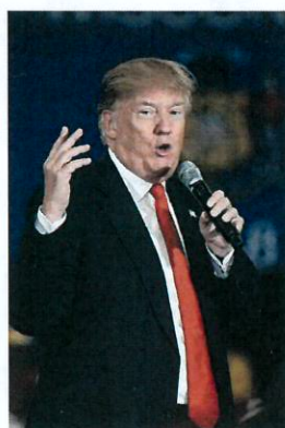
DIVISIVE: Presidential candidate Donald Trump.

Fox moderator Megyn Kelly's crime had been to ask tough questions of Trump during a televised debate about his past demeaning comments about women in life and on social media; his use of words such as “dog”, “fat” and “disgusting” to put down women.